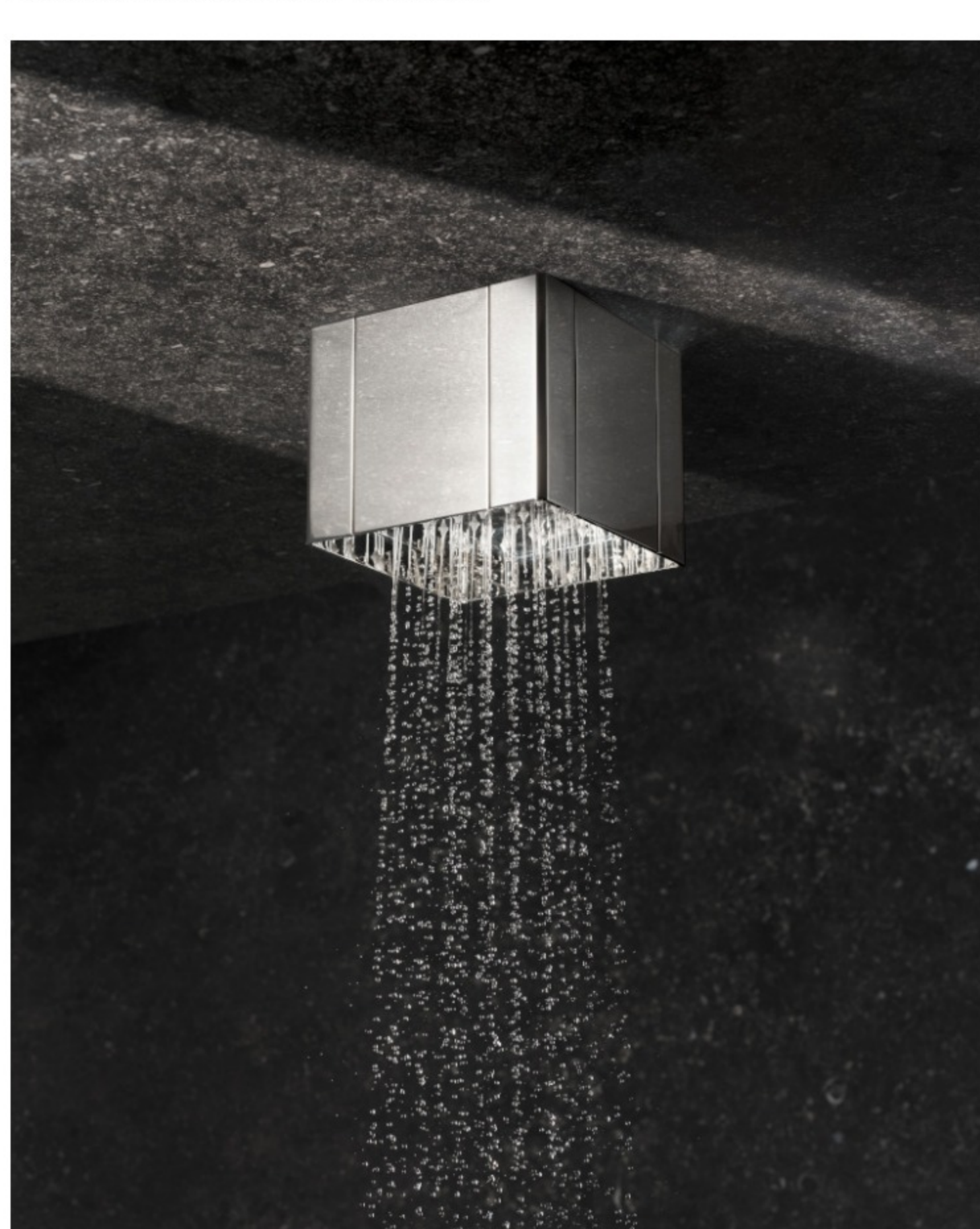
Contemporary Cube shower head from Waterworks

The Divo table lamp is new from London studio Kinkatou . The lamp is handcrafted on the wheel and features coloured baubles which add a sense of fun to the design. Standing 50cm high, Divo is available with a choice of lamp shades.