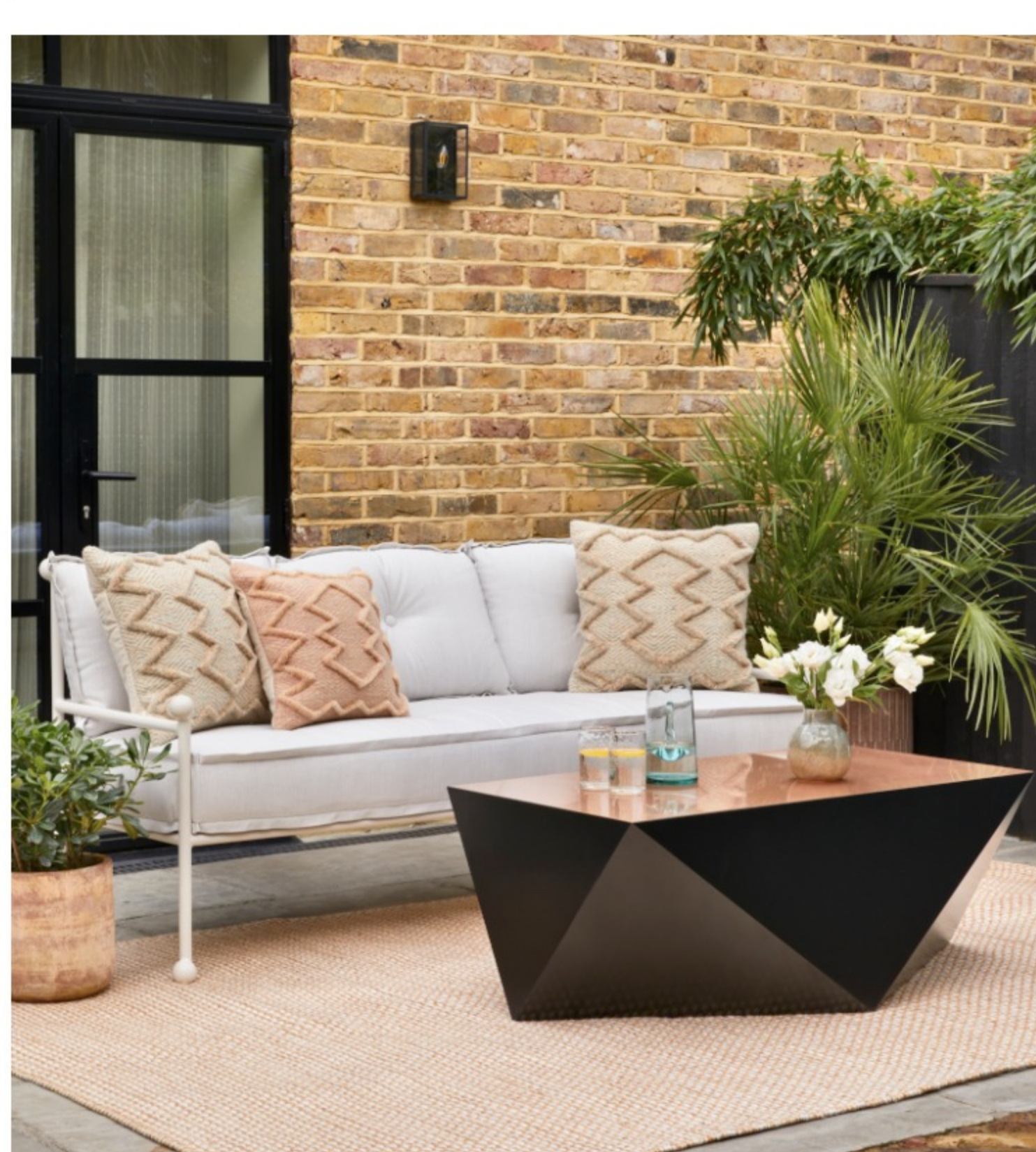
Rugs for inside and out from Holmes Bespoke

Waterworks have launched a series of new products (available from June) including this new Universal Flush Mount Cube showerhead in Nickel. Continuing the contemporary theme, the luxury brassware brand has also collaborated with GACHOT resulting in Finot. Inspired by industrial design, Finot includes taps and shower fittings plus lighting, accessories and hardware pieces.