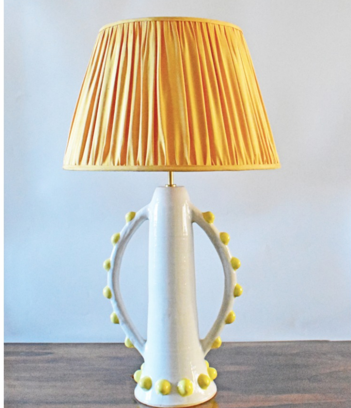
The jaunty Divo table lamp from Kinkatou

Kit Kemp's New Forest collection for Annie Selke evokes the spirit of a region that's near and dear to Kit's heart: the New Forest National Park, "It's the most beautiful and historic place, full of walking and riding trails, ancient trees and heathland," says Kit. All that rich natural beauty translated easily to the new designs, which she describes as "sophisticated, with a crafted, country feel." The New Forest collection includes handwoven rugs and embroidered cushions.